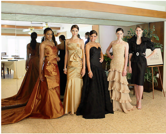
Picture taken at the Pizzazz with Jazz luncheon fashion show on May 6, 2010. Luncheon benefiting FACE Focus on Education Scholarship Fund.

MLD Limited is growing! We recently hired a pattern designer to help us with our production. We have also enlarged our studio. Looking forward to a bright future!