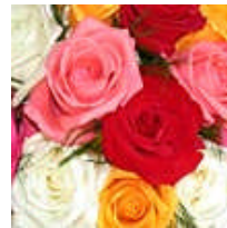
June's flower is the Rose.

Other Names: Sweetheart Rose, Hybrid Tea Rose