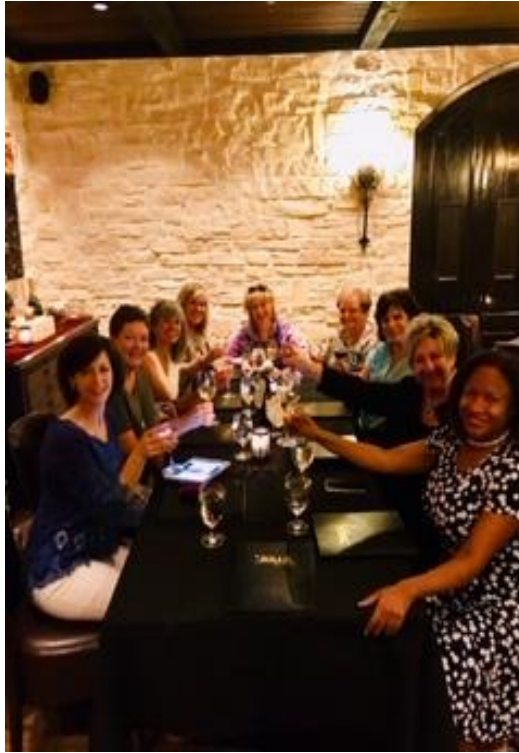
Having fun making lasagna pans at Potters Wheel